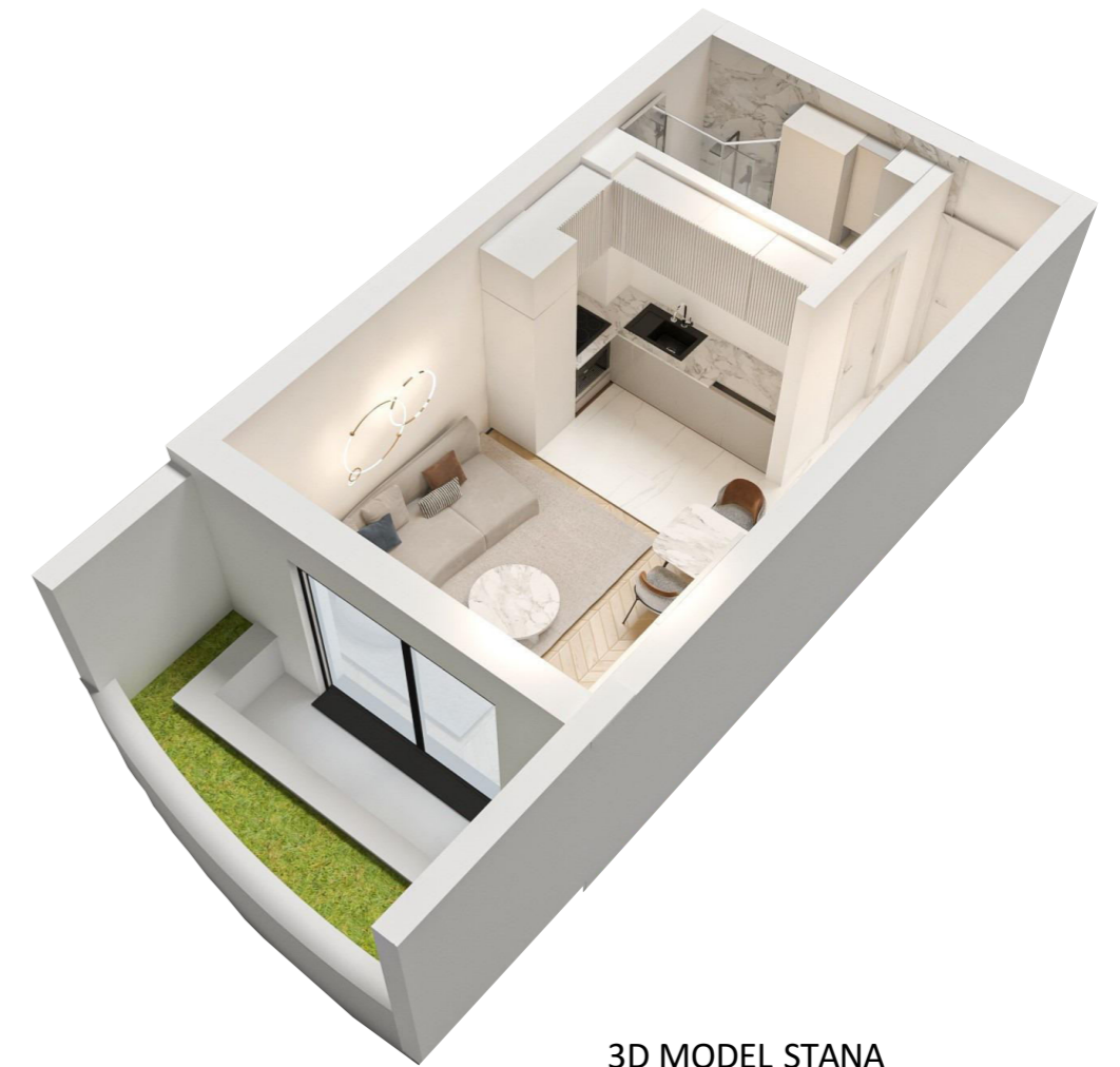
3D MODEL STANA